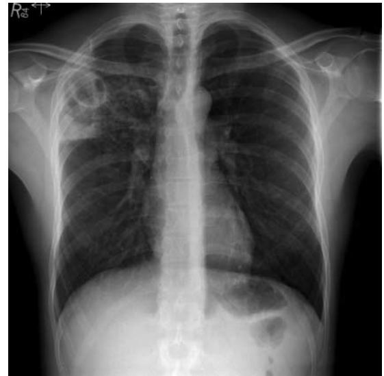
Fig 3 | Chest radiograph showing cavitating disease in patient with multidrug resistant tuberculosis

UK guidelines on risk factors for multidrug resistant disease are summarised in box 2. When multidrug resistant tuberculosis is strongly suspected—for example, if a patient fails a second course of treatment—it may be necessary to start treatment before susceptibility results become available, taking into account antituberculosis drug resistance patterns in the setting where infection was most likely to have been acquired and the patient’s own treatment history. Empirical treatment includes at least three drugs likely to be effective. The regimen can be modified as soon as susceptibility results become available. 18 We believe